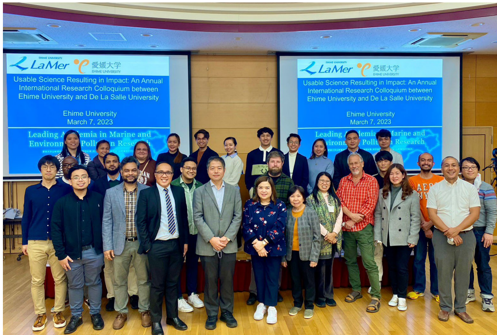
Figure 1. Participants of the LaMer Symposium 2023.

The Leading Academia in Marine and Environment Pollution Research (LaMer) Symposium with a theme “Usable Science Resulting in Impact: An Annual International Colloquium between the Ehime University and De La Salle University” was held last 07 March 2023 at the Media Hall, Ehime University. The symposium aims to convene professors, researchers, and PhD students of EU and DLSU.