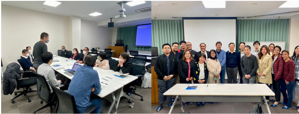
Figure 5. Collaboration meeting between CMES and DLSU.